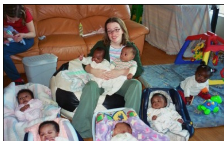
Another wonderful volunteer up to her elbows in babies!