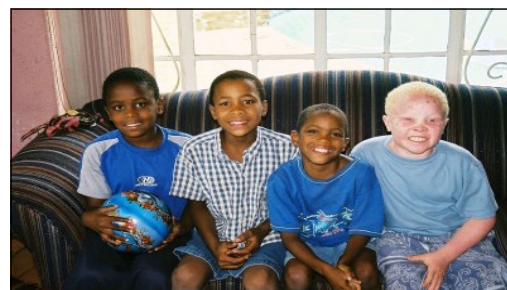
The older boys in a rare quiet moment!