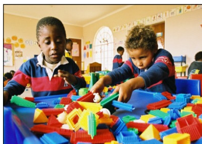
Learning is fun at the TLC school!